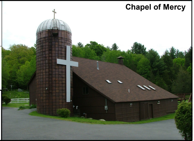
Chapel of Mercy