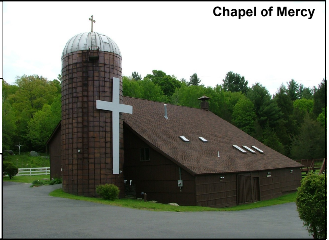
Chapel of Mercy